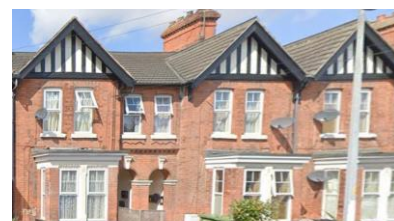
Restored Ainslie Street Properties

Once in the possession of the Council, the properties were put up for sale, with council grants available to assist purchasers with the costs of renovation. The then portfolio holder for regeneration and strategic housing, Councillor Geoff Lewis, said at the time: "I'm very pleased to see the end of a long legal process and I now look forward to seeing these eyesore properties being renovated and occupied".