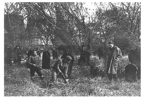
Duchess Street the day after the raid, a butterfly bomb hanging for a tree and prisoners of war, under the supervision of bomb squad officers, searching for butterfly bombs in Doughty Road Cemetery

Once the danger of the anti-disturbance fuse bombs became known, the people of the area demanded that every property should be searched for butterfly bombs. In response to this demand a colossal search, comprising of over 10,000 personnel, began on 19 th June. However, despite their best efforts, by the time the search was declared complete on the 9 th July, 114 people had been killed, a figure that equates to over half of all of those who lost their lives in the local area during 37 raids over 5 years.