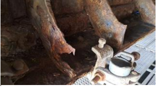
Corrosion on the Bridge

The Heritage Group have requested a further visit to Corporation Bridge in light of the fact that the it has now been announced that works on the Bridge are now delayed for an indefinite period. North East Lincolnshire Council have reported that the delay is due to corrosion, which was more severe than expected, being revealed following the initial shot blasting. There is now some concern that the available funding will not be sufficient to complete the repairs.